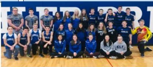
70 Student-Athletes recognized All-Conference

4 Individuals taking athletics on at the Intercollegiate level