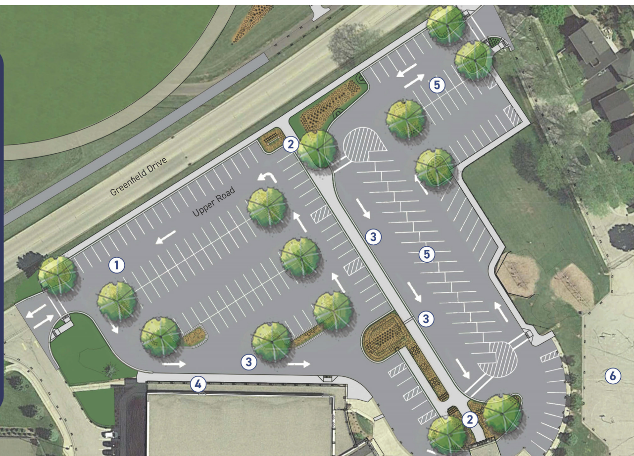
Rendering of the parking lot reconfiguration