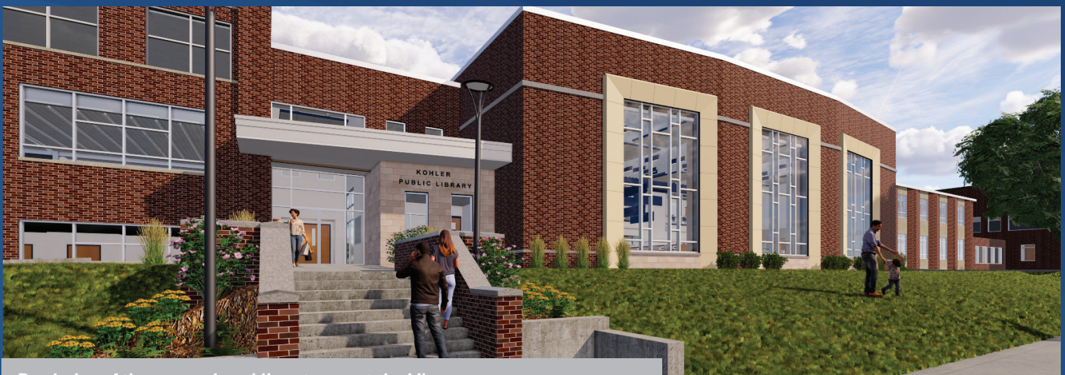
Rendering of the new main public entrance at the Library

The Ebben Field focus group, made up of the school administration, athletics faculty and coaches, and Village Recreation Department staff, is finalizing upgrades for Ebben Field. Please stay tuned for more information!