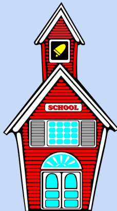
Kohler Middle School