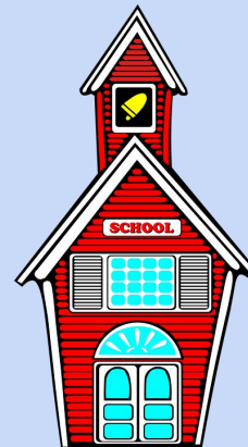
Kohler High School