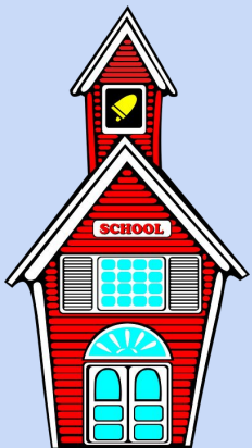
Kohler Elementary School